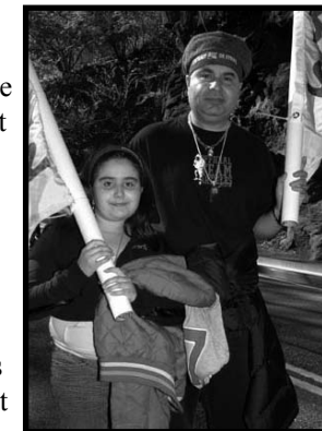
Brochure by Linda Gluck Graphic Design

A family childcare provider speaks out on behalf of her diverse workforce