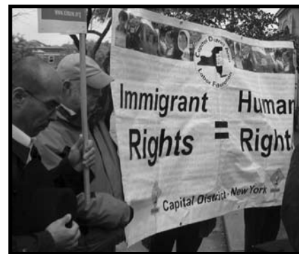
Praying for moral solutions

The Hindu scripture Taitiriya Upanishad tells us: "The guest is a representative of God." (1.11.2)